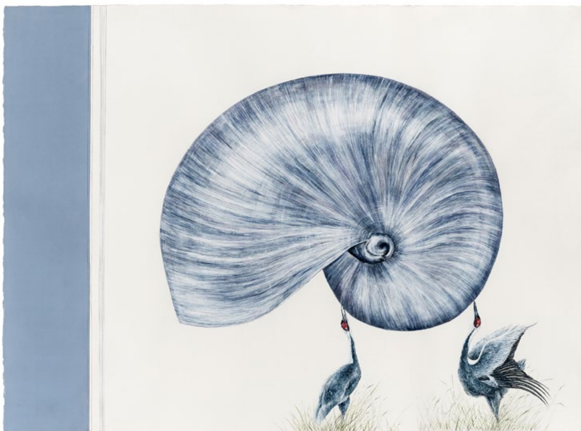
Untitled, 2016, Pastel and Collage on Paper, 80 x 122 cm Untiteld, 2023, Acrylic and Thread on Paper, 78 x 108 cm