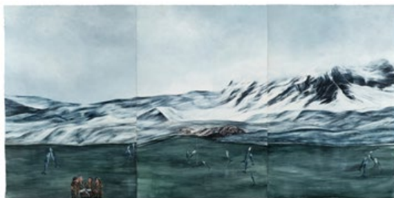
Untitled, 2018, ea.85 x 52 cm Three Piece Work, Acrylic and Collage on Paper

Cycles repeatedly show up in my Paintings. Sometimes, they enlarge in the form of snail shells, assuming a major part of an artwork's visual space, as if concentrating more on the small elements that used to be part of a bigger visual space, having become the main subjects now. Yet, the snail shells still remind us of the rotational feature recurring in these paintings. It seems that by painting these enigmatic imaginary or eerie landscapes, I am allowing thoughts to reveal themselves, repeating a train of thought with no beginning that leads us to unanswered questions about life, death, anxiety or whatever we are living with. It seems as though it is more of a bid to leave the viewer with unanswered questions in the middle of a pristine, snow-filled nature.